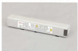
Spare Lithium Ion battery pack