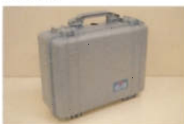
Carrying trunk case

Specifications and appearances are subject to change without notice.