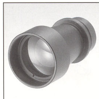
3 X Long eye relief eye piece (option)